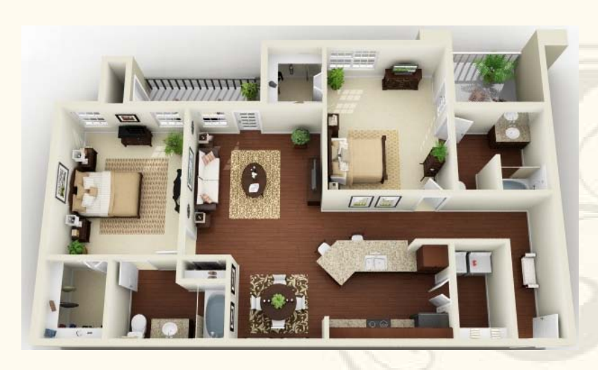
1238 Sq. Ft. - 2 Bed / 3<sup>rd</sup> Floor