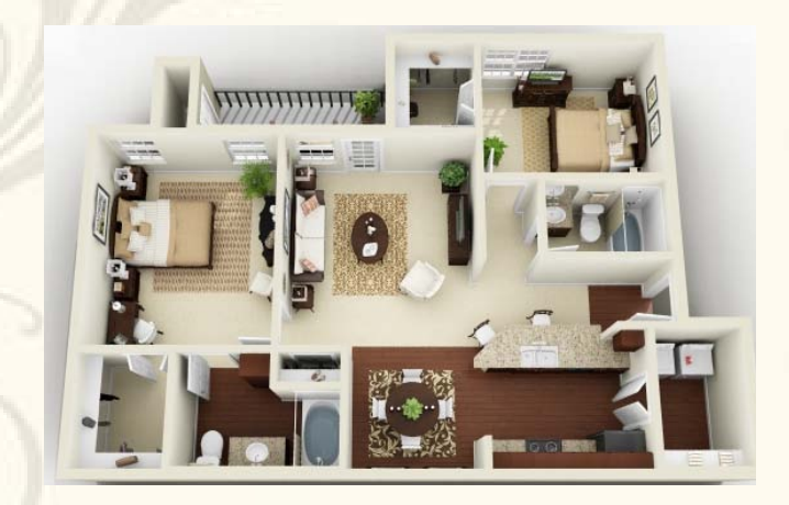
1065 Sq. Ft. − 2 Bed / 2 <sup>nd</sup> Floor