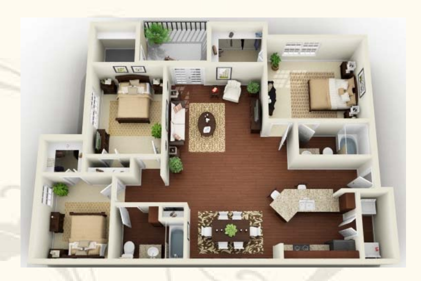
1364 Sq. Ft. - 3 Bed / 1<sup>st</sup> Floor

JAMESTOWN PLACE APARTMENT HOMES 5400 Barksdale Blvd Bossier City, LA 71112 Main # 318.588.7777