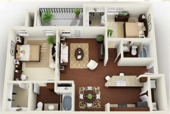
1037 Sq. Ft. - 2 Bed / 1<sup>st</sup> Floor