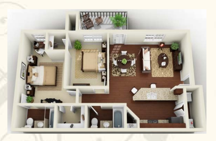
914 Sq. Ft. - 2 Bed / 1<sup>st</sup> Floor

Excitement is buzzing in South Bossier City, where brand new luxury living has a new standard of elegance and practicality ... Jamestown Place Apartment Homes. Boasting ten elegant 1, 2 and 3 bedroom floorplans ranging from 724 to a spacious 1,392 square feet, Jamestown Place dazzles residents with sensational interiors spiced with incredible features and recreational amenities.