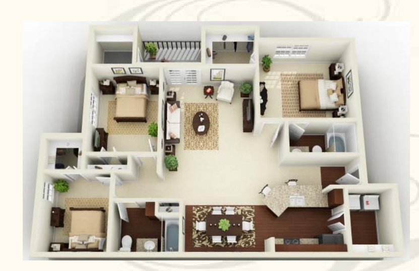
1392 Sq. Ft. - 3 Bed / 2<sup>nd</sup> Floor