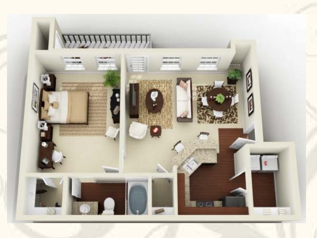
724 Sq. Ft. - 1 Bed / 2<sup>nd</sup> & 3<sup>rd</sup> Floor