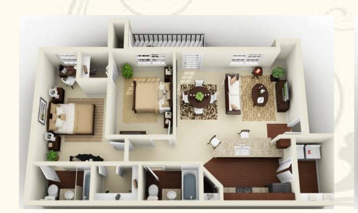
943 Sq. Ft. - 2 Bed / 2<sup>nd</sup> Floor